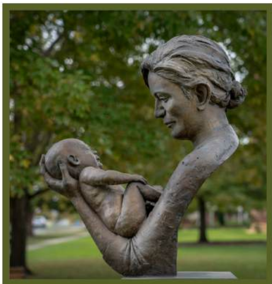
2 - MOTHER & CHILD BRONZE SCULPTURE ANDREW POPPLETON